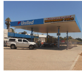
Stuart Hwy, Barmera