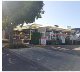
101 Prospect Road, Prospect