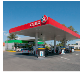
150 Brighton Rd, Somerton Park