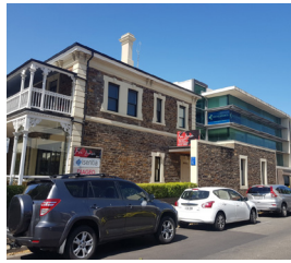
143 Hutt Street, Adelaide