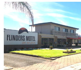
Flinders Motel, Port Pirie