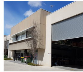
119 Hayward Ave, Torrensville