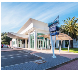
Watermark Hotel, Glenelg