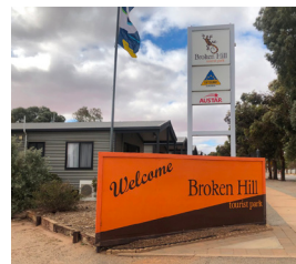
Broken Hill Tourist Park