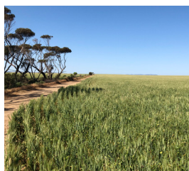
Cropping Land, Bute