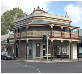
190 Unley Rd, Unley