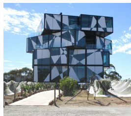
The Cube, McLaren Vale