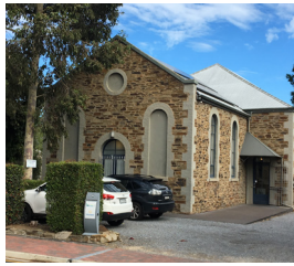
6 George St, Stepney