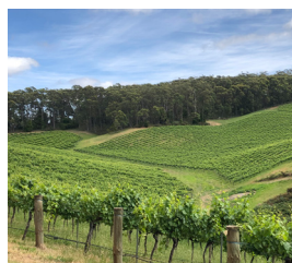
Pike's Vineyard, Lenswood