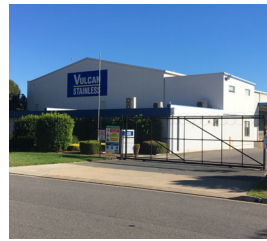
14-16 Pambula St, Regency Park