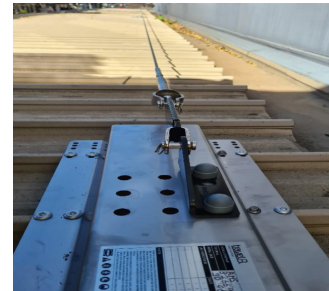
176 Grenfell St, Adelaide Roof safety system