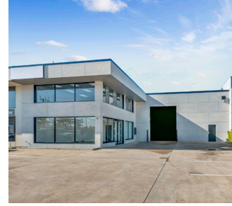
59 Goodwood Rd, Wayville Whole building upgrade