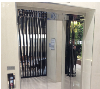
300 Flinders St, Adelaide Lift replacement