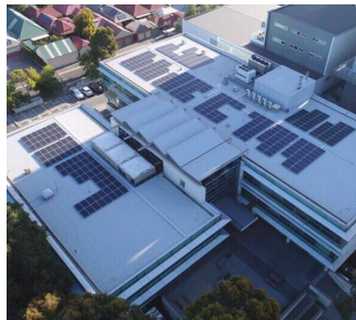
AGL Building - 226 Greenhill Rd, Eastwood 100 kW solar system installation