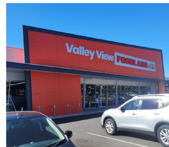
The Junction Shopping Centre, Valley View Repaint of whole exterior