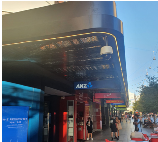
112 Rundle Mall, Adelaide Building canopy replacement