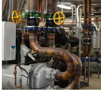
108 North Tce, Adelaide Chiller replacement