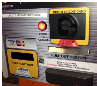
Centrepoint - 162 Rundle St, Adelaide Carpark equipment replacement