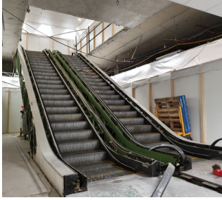
Centrepoint - 162 Rundle St, Adelaide Escalator replacement