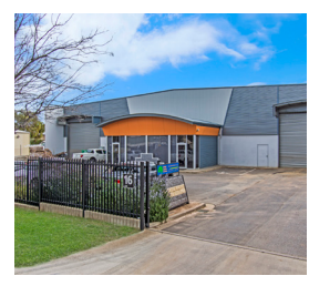
16 Aristotle Cl, Golden Grove