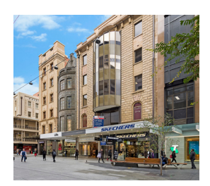
51 Rundle Mall, Adelaide