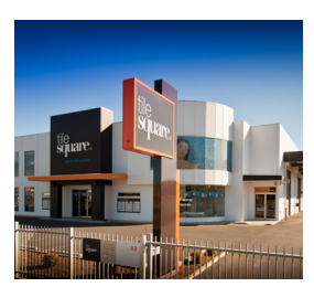
83 Research Rd, Pooraka