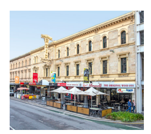
Malcolm Reid Building, Adelaide