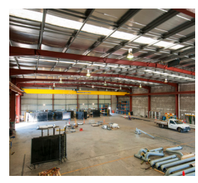
13 Rosberg Rd, Wingfield