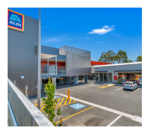
Aldi Supermarket, Blackwood